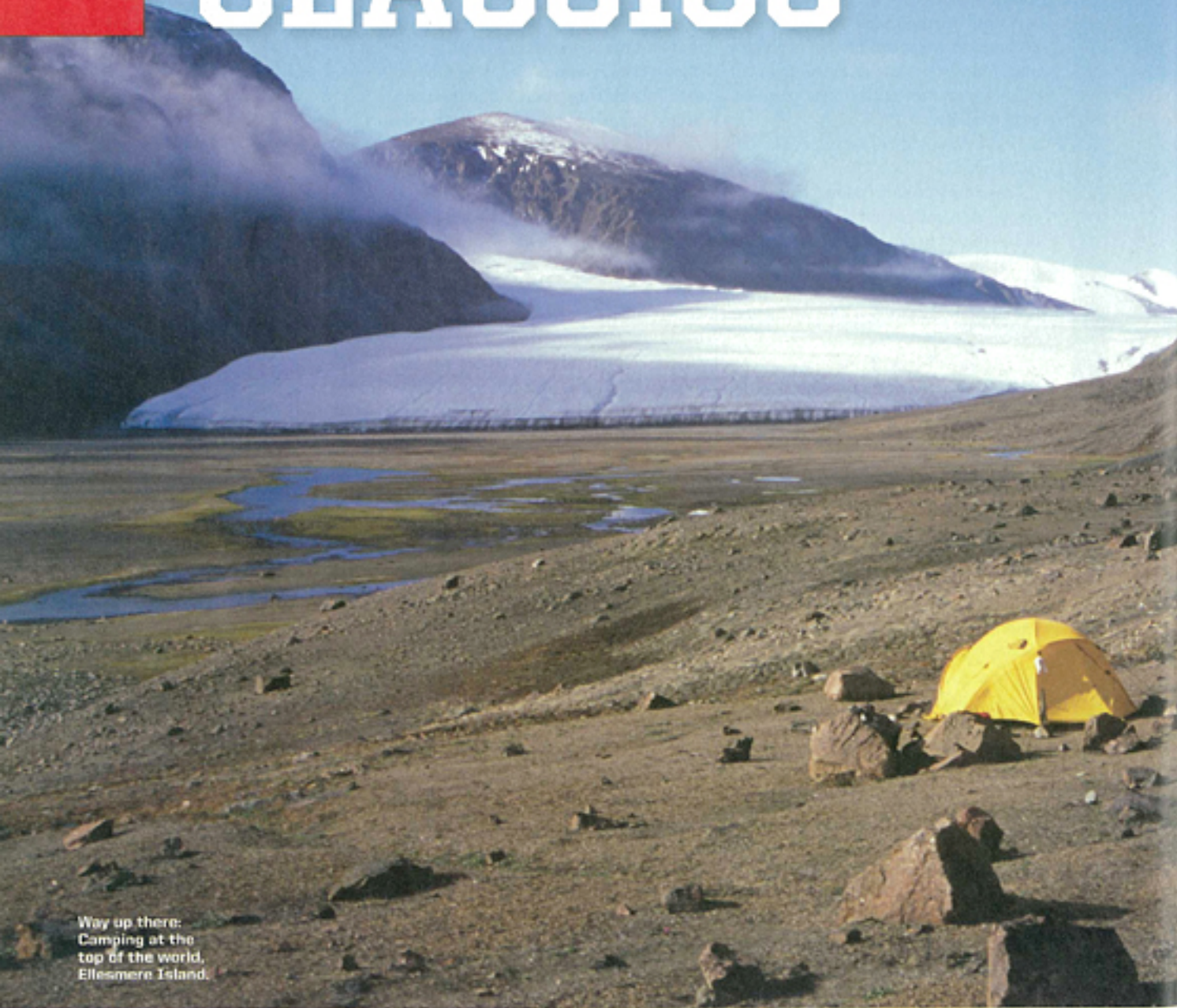
Way up there: Camping at the top of the world, Ellesmere Island.