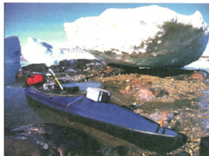
At low tide, everything goes aground

Eskimobeyn was rediscovered by a Norwegian Explorer named Otto Sverdrup over 100 years ago. Sverdrup is credited with the discovery and mapping of over a third of what is now Nunavut's high Arctic Islands. Sverdrup and a fellow Norwegian named Fridtjof Nansen were the first successful Arctic explorers. 'Success' in the Arctic exploration arena in the latter part of the 19th century simply meant that one's crew didn't die of scurvy, starvation, or freeze to death! Sverdrup and Nansen accomplished this by using traditional methods to travel and hunt. They also broke out of the traditional "Conquer the North" attitude that many European explorers held, and worked with the elements, instead of against them. This part of Canada's newest territory was