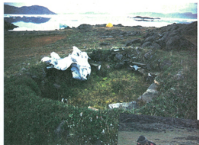
Thule people's housepit with Bowhead whale skull

While my hometown of Kimberley was fast asleep under a darkened southern sky, I was dreaming Arctic dreams under the midnight sun. □